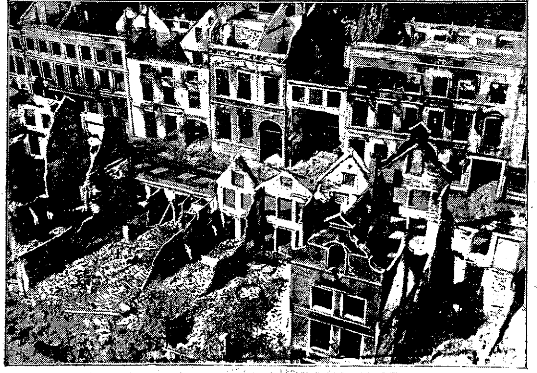
BIRD'S-EYE VIEW OF RUINS OF TERMONDE, BELGIUM