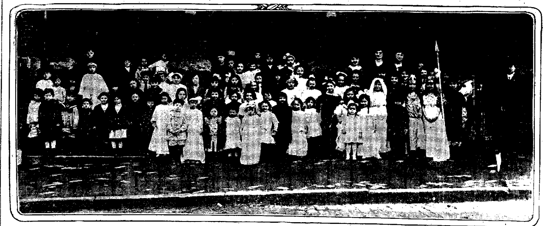
Photo shows children of Ahavath Zion Sabbath school as they appeared at the Purim celebration at the Gilmer street Temple.