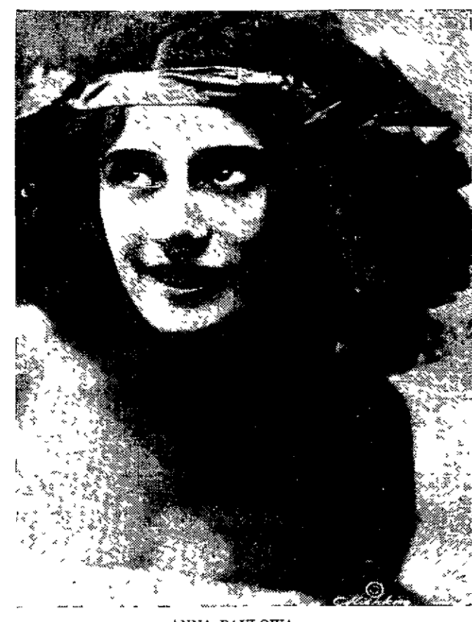
As she appears when dancing the Bacchanale