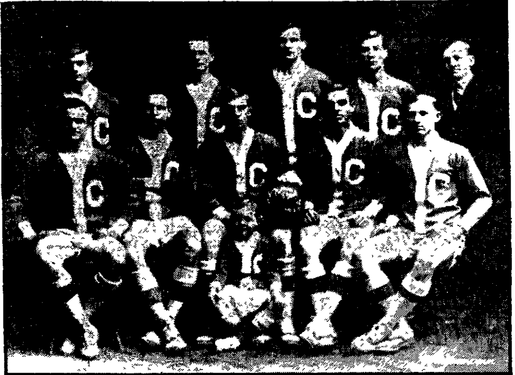
The Columbus Young Men's Christian Association basketball team that will play in Birmingham tonight...