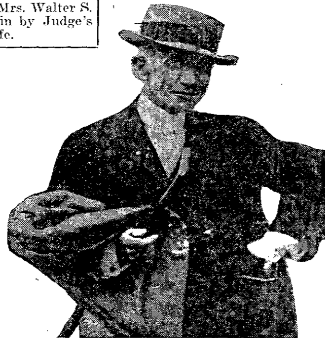
SCENES OF MILLEN SHOOTING AND TWO VICTIMS.