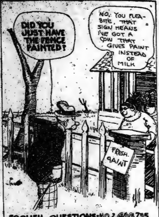
FOOLISH QUESTIONS-NO. 2, 468, 735.