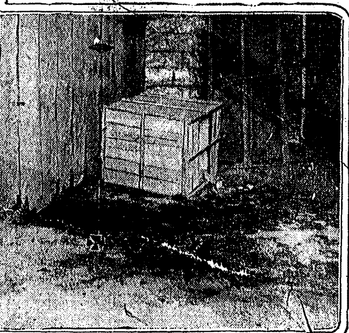
DESOLATE RECESS IN BASEMENT WHERE BODY WAS DISCOVERED. X indicates where body lay. Signs of girl's struggle in foreground.