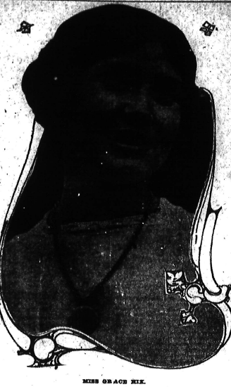
MISS BRACK III