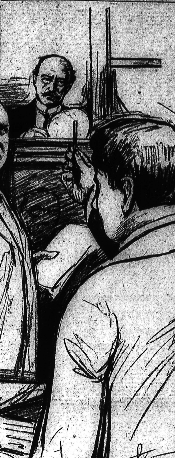
FRANK ON TRIAL The courtroom scene... The courtroom scene... The courtroom scene...