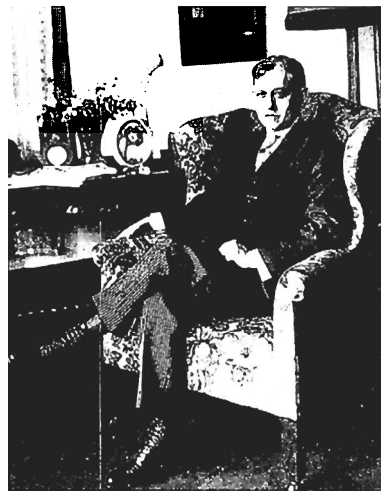
Dorsey's success as prosecutor in the Frank case aided his gubernatorial victory in Georgia in 1916.