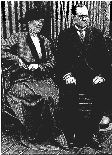
Gov. John M. Slaton and his wife. The governor commuted Frank's death sentence, in 1915.

But the mob would not be thwarted. A fellow inmate at the state prison farm cut Frank's throat. While he was recovering in the hospital infirmary, a band of twenty-five men, characterized by their peers as "sober, intelligent, of established good name and character—good American citizens," stormed the prison farm, kidnapped Frank, and drove him 175 miles through the night to Marietta, Mary Phagan's hometown, where, on the morning of August 17, 1915, they